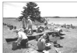
MAPI Field School in Machias Bay

enabled an experimental form of sub-surface radar to locate anomalies in frequency responses that could represent rocks and other evidence of cultural activity buried in the plowed fields and other landscape features above the 62.1 petroglyph ledges. The elec-